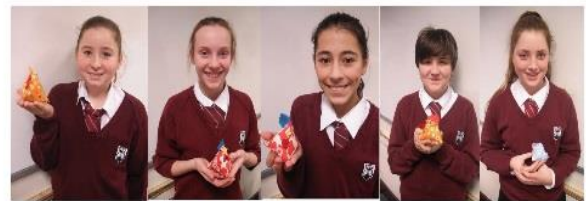
Pyramid beanie chicken - Textiles Club