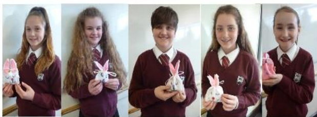
Textiles Club - Easter bunny pouches