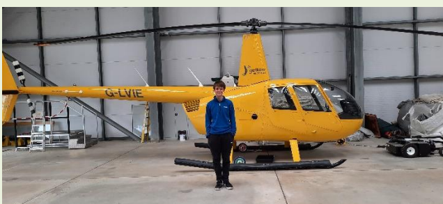
The Private Jet Company