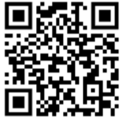
Diana Award Anti-Bullying