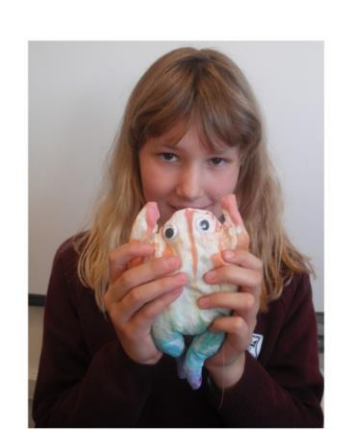
KS3 Textiles club workshop. Tie dyed beanie frogs.