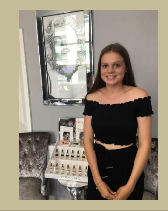
The Signature Room