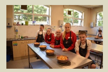
Some great work everyone, well done!