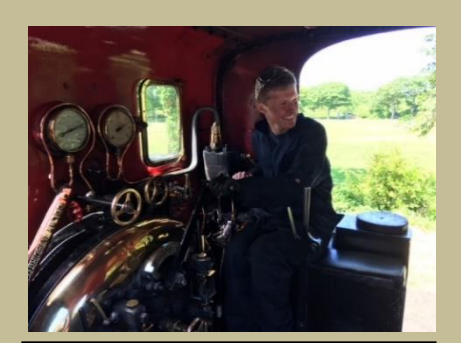
Isle of Man Transport