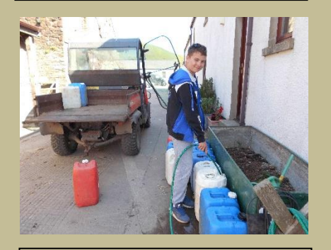
Knockaloe Beg Farm