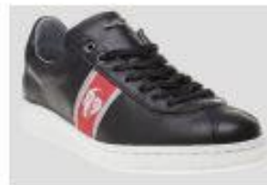
Obvious coloured branding