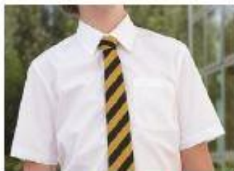
Shirt buttoned up & tie worn correctly