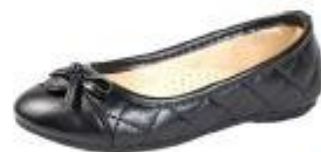
Brown or black shoes capable of being polished.