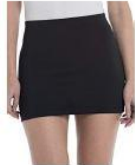
Short / bodycon skirts