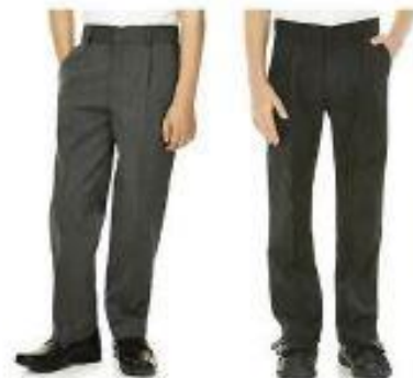
Grey or black smart trousers.