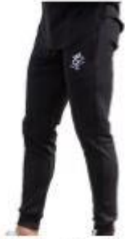
Tracksuit style trousers or jeans