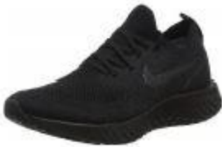
Black trainers / converse – not polishable.