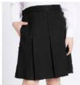
Skirts below fingertip length.