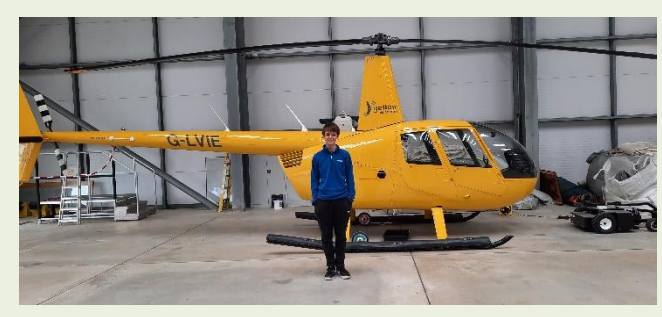
The Private Jet Company