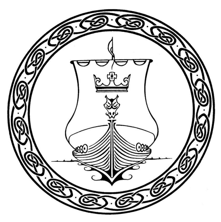
gleck dty share dy kinjagh